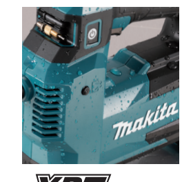
eXtreme Protection Technology